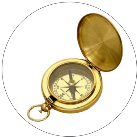
A compass made by the cluster artisans

Promoting environmentally conscious manufacturing