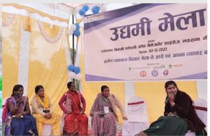
Women entrepreneurs in a conversation at the udyame Mela (Enterprise Fair) organised by DA in Mirzapur, Uttar Pradesh.

IMEDF is a social enterprise vehicle of the Development Alternatives Group. Its major lines of business are cluster development, micro enterprise development and capacity building.