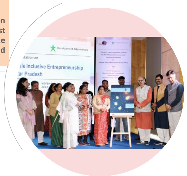
Stakeholders unveil Fireflies of Social Change, a compendium of 20 case stories of entrepreneurs.

As we unveil our vision for 2027 with the goal of creating 1 million jobs, the shared commitment demonstrated by stakeholders from government, academia, civil society, financial institutions, and the development sector brings this vision closer to reality. This promising collaboration marked the beginning of achieving our shared dream of empowering rural communities.