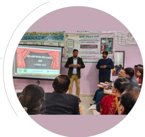
KBBL organised in udyame Vaani geography

Scan now to be a social investor on rangde.in