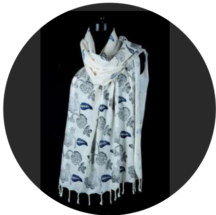
Indigo-dyed Stole made by the artisans