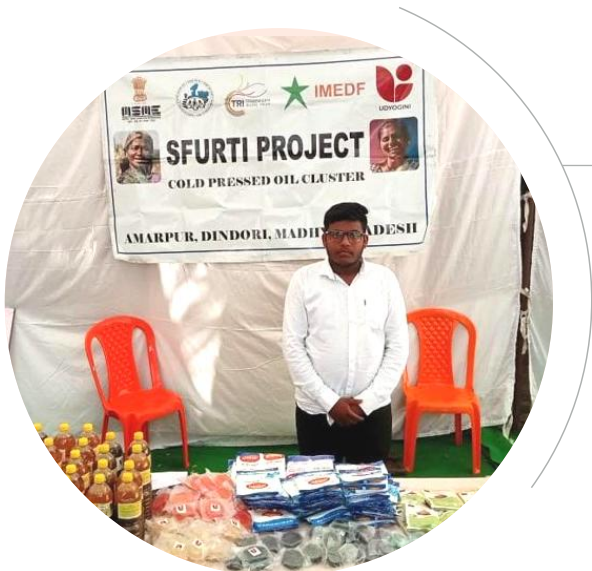
Cold Pressed Oil manufactured by women led Dindori cluster