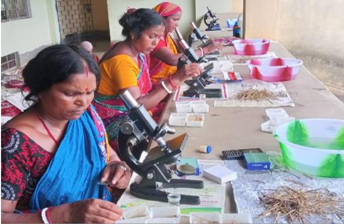
Women artisans inspecting cocoons using microscopes at the Common Facility Centre in West Bengal.

Indian Micro Enterprises Development Foundation ...making entrepreneurship possible!