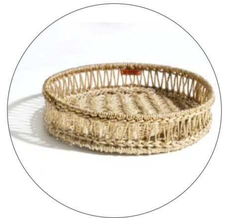
A gift basket made by the women artisans

The 311 women-only cluster makes exquisite utility products such as baskets with upcycled textile industry waste that are hugely loved by connoisseurs of art. The products are sold under the brand - SIROHI at www.sirohi.org