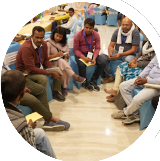
Partners from Urmul, ATREE, Panorbit Services Pvt Ltd, IINREM, CREATE, Tarasankar Panchgram Seva Samiti (TPSS), and Child & Social Welfare Society (CSWS) undertook the Yatra.