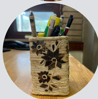
Products being made by the artisans of Labpur Banana Fibre Cluster, West Bengal.