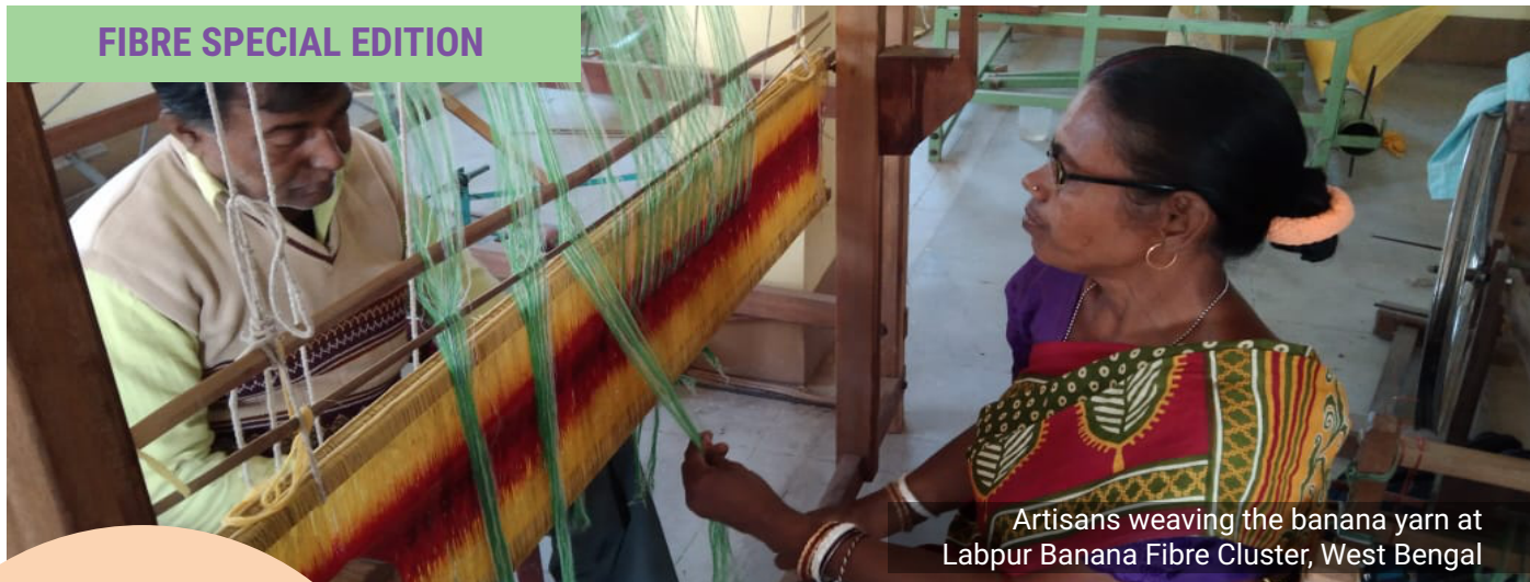
Artisans weaving the banana yarn at Labpur Banana Fibre Cluster, West Bengal

IMEDF is a social enterprise vehicle of the Development Alternatives Group. Its major lines of business are cluster development, digital and retail services, and capacity building.