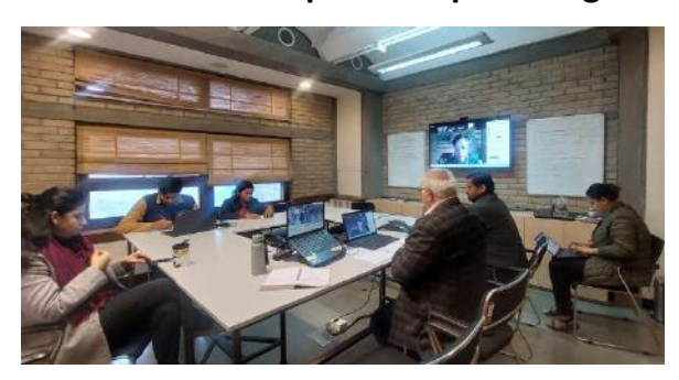
Session on Empowering Rural Innovations through Market Linkages