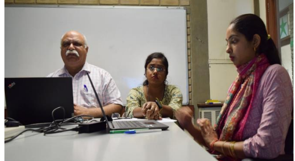
Ongoing presentation during the workshop

he Indian Micro Enterprise Development Foundation (IMEDF), a special purpose vehicle of the Development Alternatives group, organised the third online workshop in the series specially designed for enterprises, clusters, and small-scale entrepreneurs. The workshop was conducted on 30th July 2024.